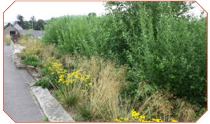
(d) Wildlife Garden