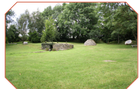
Cranavane Holy Well

This lane then meets the Myshall road (R724), to continue turn right for 50 metres and then turn left onto “Bayley’s Lane”, or you may wish to take a short detour (1 km each way), back in the direction of Kildavin, to take in the beautifully kept Cranavane Holy Well 6 . It can of course, be accessed by car at a later stage. Either way, it is well worth a visit as its atmosphere of peace and tranquillity will not disappoint.