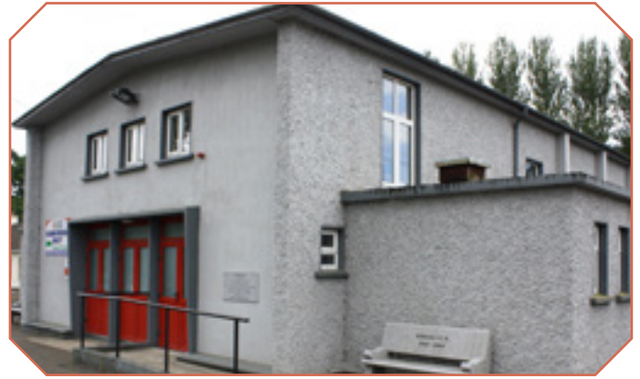
(f) Spellman Hall