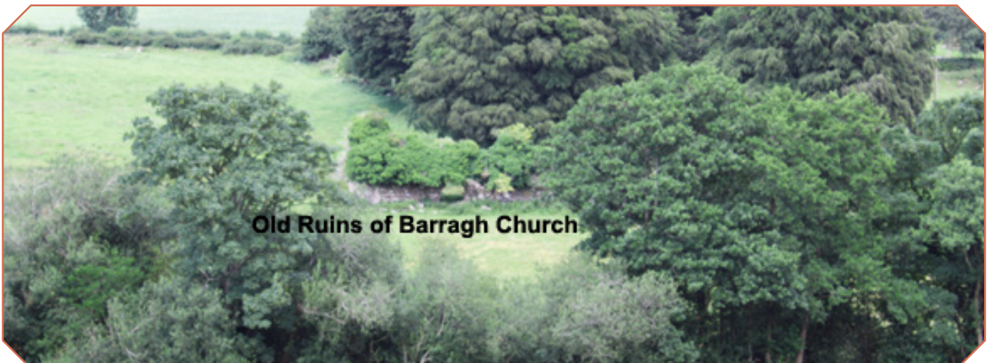
Old Ruins of Barragh Church

At the end of this lane turn left heading back for Kildavin. From this vantage point you can get a good view over the old ruins of Barragh Church and graveyard ( below ) 7 . It is a pleasant 3.5 km walk past Cranemore and Ballyshancarragh back down into the village of Kildavin.