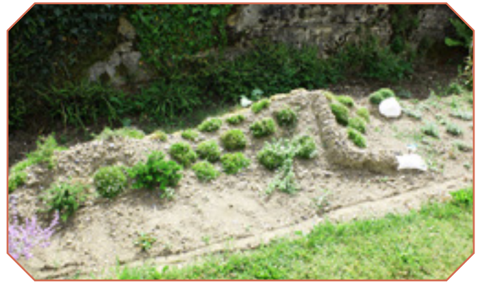
(h) Mother Earth Garden