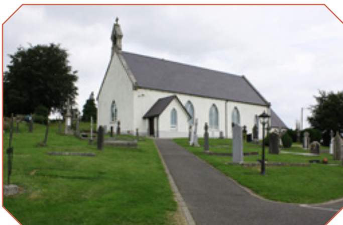
(a) St. Lazerian's Church