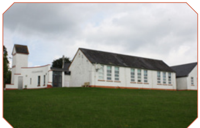
(b) Kildavin National School