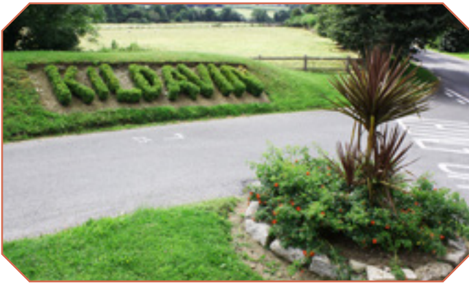
(g) Kildavin Box Hedging