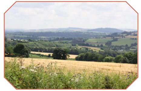
Some of the spectacular views from the highest point of this route

Turning west at the end of this lane it is necessary to cross the busy N80 road. On the opposite side “Ballinvalley Lane” (signposted L60664) awaits. A short walk uphill will bring you to the highest point on this route with spectacular views at every turn ( photos above ).