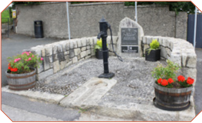
(e) 1798 - 1916 Memorial